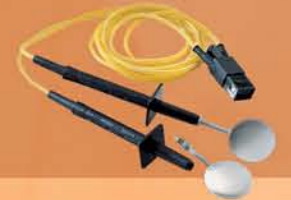
INTERNAL ELECTRODES FOR CARDIAC SURGERY