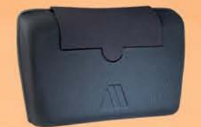
ACCESSORY BAG FOR RESUSCITATION ITEMS