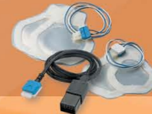
DEFIBRILLATION / PACER ELECTRODES