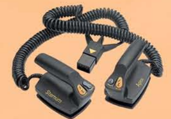
COMBINED PEDIATRIC / ADULT PADDLES