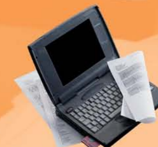
CODELOG DATA STORAGE (SOFTWARE)