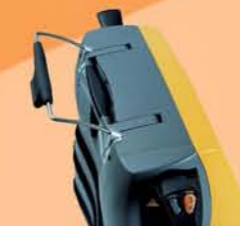
BED HOOK FOR RAIL AND BED MOUNTING